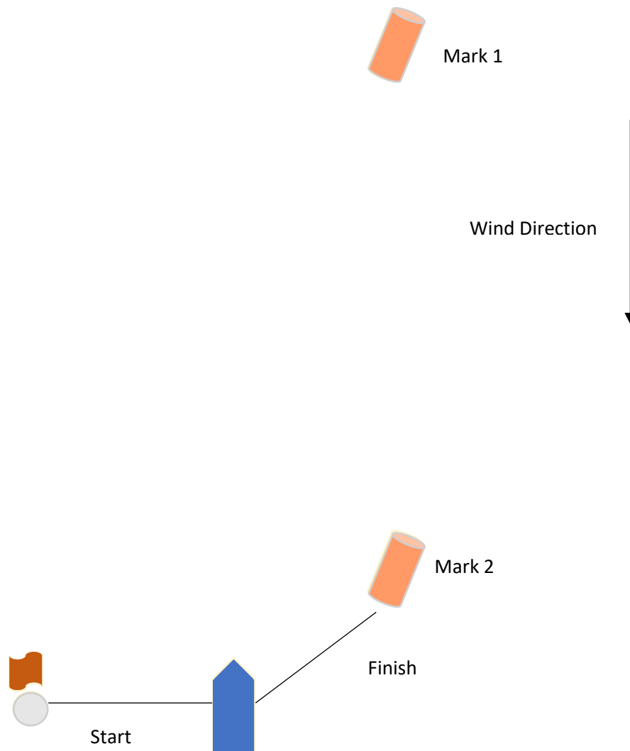
Diagram not to scale

The number of laps to be sailed by each class will be displayed on a board on the committee boat and advised on VHF Channel 77.